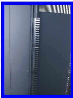
View of cable claw